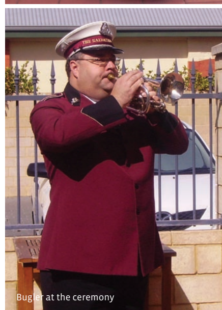
Bugler at the ceremony